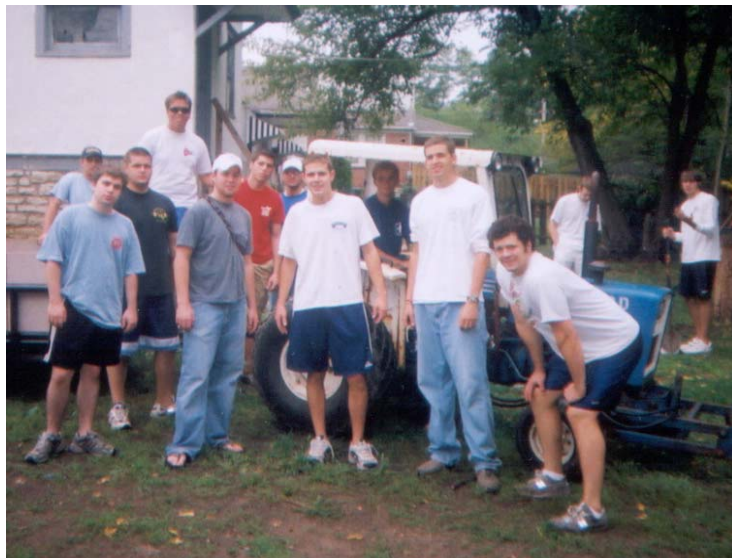
Above: Several actives gather for a picture during the Old TKE-Annex clean-up day in mid-April.